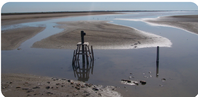
Illustration of the very low water depths that can occur on the site, with the possibility of most areas drying up for part of the year.