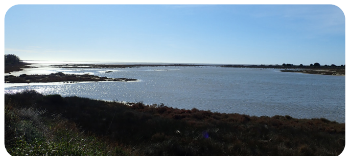
One of the coastal lagoons targeted for restoration, in the south of the buffer area, © Fontes, Tour du Valat.