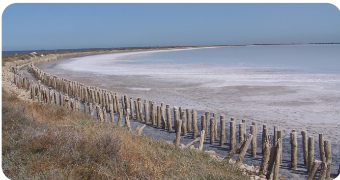
Illustration of the very high salinities that can occur on the site, with possible salt crystallisation.

During REST-COAST, the objective is to restore 300 ha of coastal lagoons, and 60 ha of Mediterranean halophilous scrubs/ Salicornia and other annuals colonising restored mud/sand. It is also expected that with the non-maintenance of the historic sea-dikes protection and the re-establishment of natural coastal dynamics, new beach areas will appear in the south of the site (overwash processes).