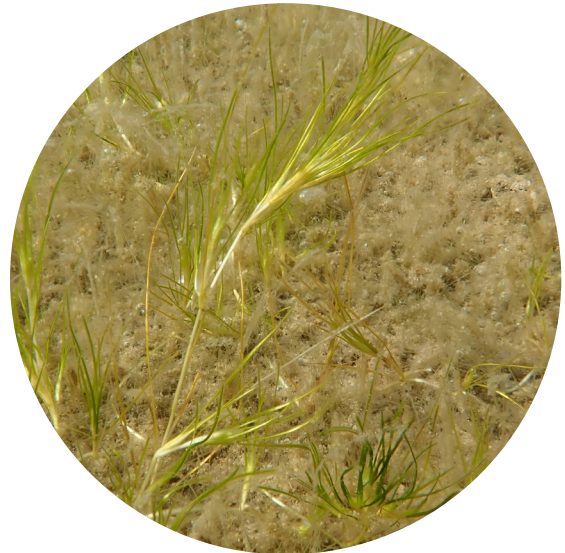
Althenia filiformis