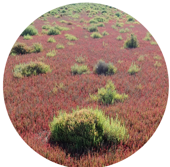
Salicornia and other annuals colonising mud and sand © Fontes, Tour du Valat.