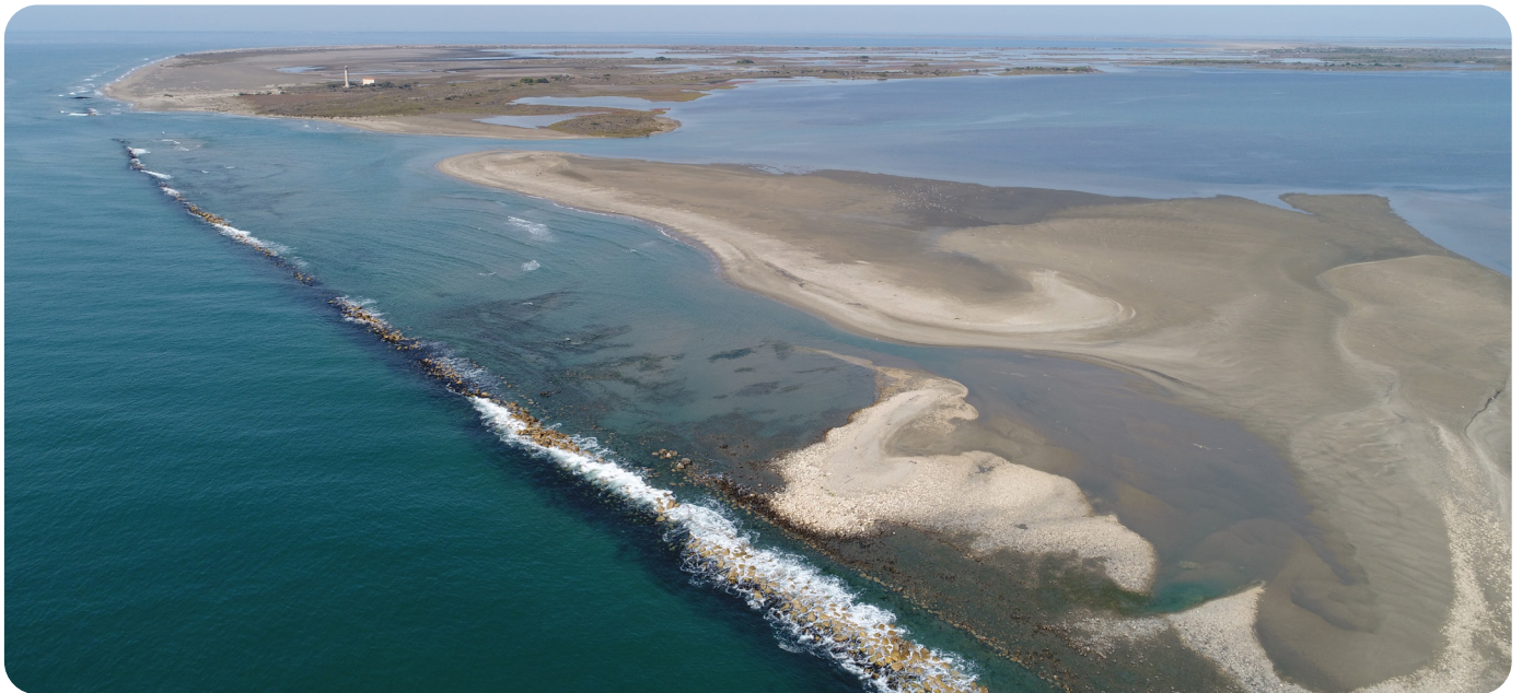
Illustration of the restoration of the natural coastal dynamics in the south of the buffer area, due to the non-maintenance of the historic sea-dikes protection. Mediterranean Sea – left, lagoons – right. © Willm and Arnaud, Tour du Valat.