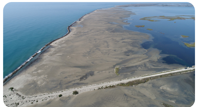
Illustration of the appearance of new beach areas in the south of the buffer area, due to overwash processes in the context of non-maintenance of the historic sea-dikes protection. Mediterranean Sea – left, lagoons – right. © Willm and Arnaud, Tour du Valat.