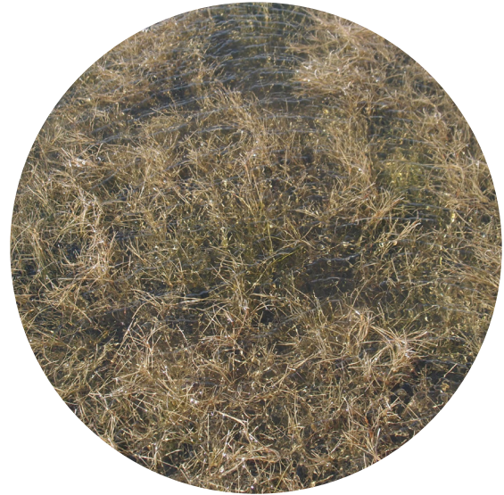
Ruppia cirrhosa