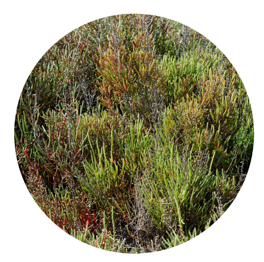
Salicornia Arthrocnemum fructicosum

With this in mind, the major risks the project will have to address include flooding/erosion and the improvement of water quality in the coastal lagoons.