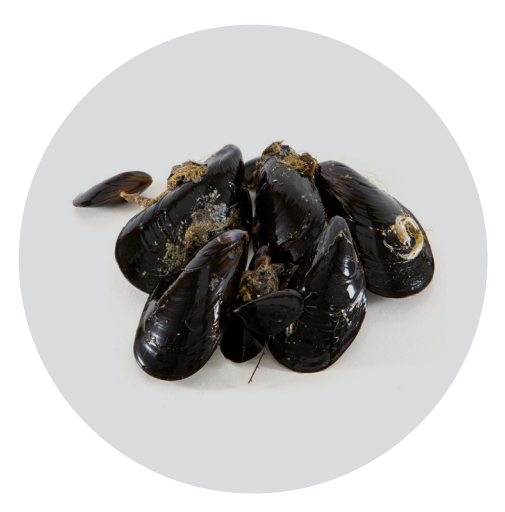
Mediterranean mussel Mytilus galloprovincialis