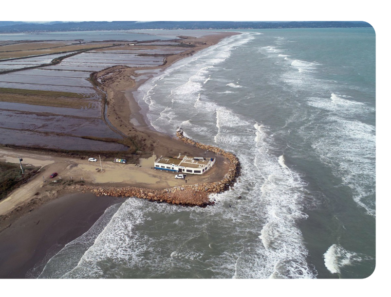
Rigid coastal structure protecting the Vascos restaurant.