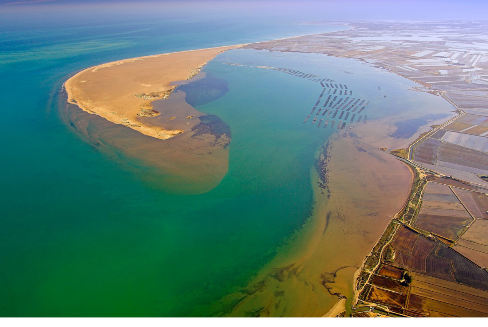
Fangar Bay, in the northern hemidelta, with the bivalve farms