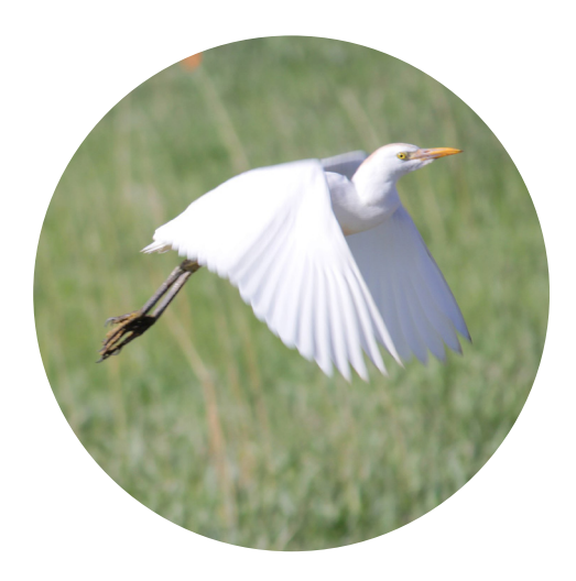
Cattle egret Bubulcus ibis