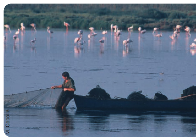
Artisanal fishing in the Ebro Delta