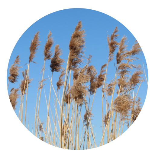
Common reed Phragmites australis