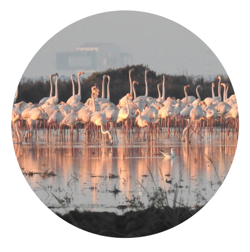
Greater flamingo Phoenicopterus roseus