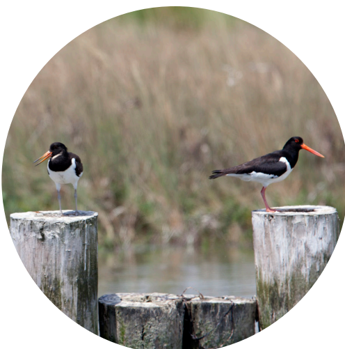
Eurasian oystercatcher Haematopus ostralegus