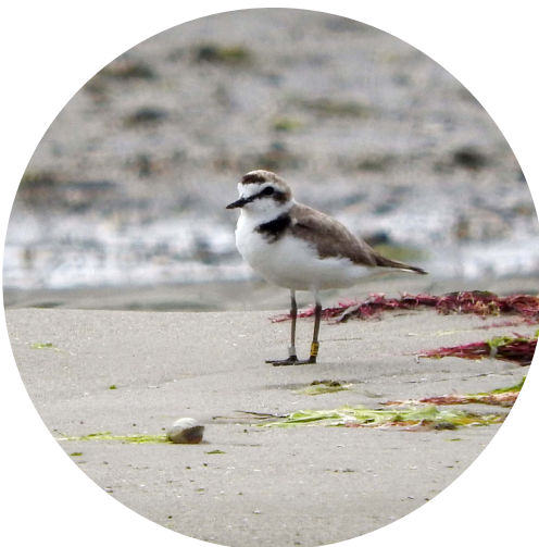
Kentish plover Charadrius alexandrinus