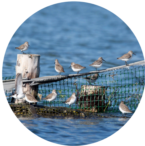
Dunlin Calidris alpina