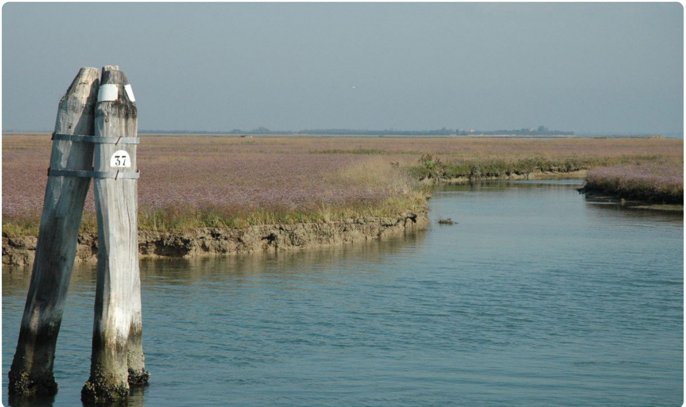
View of a natural saltmarsh