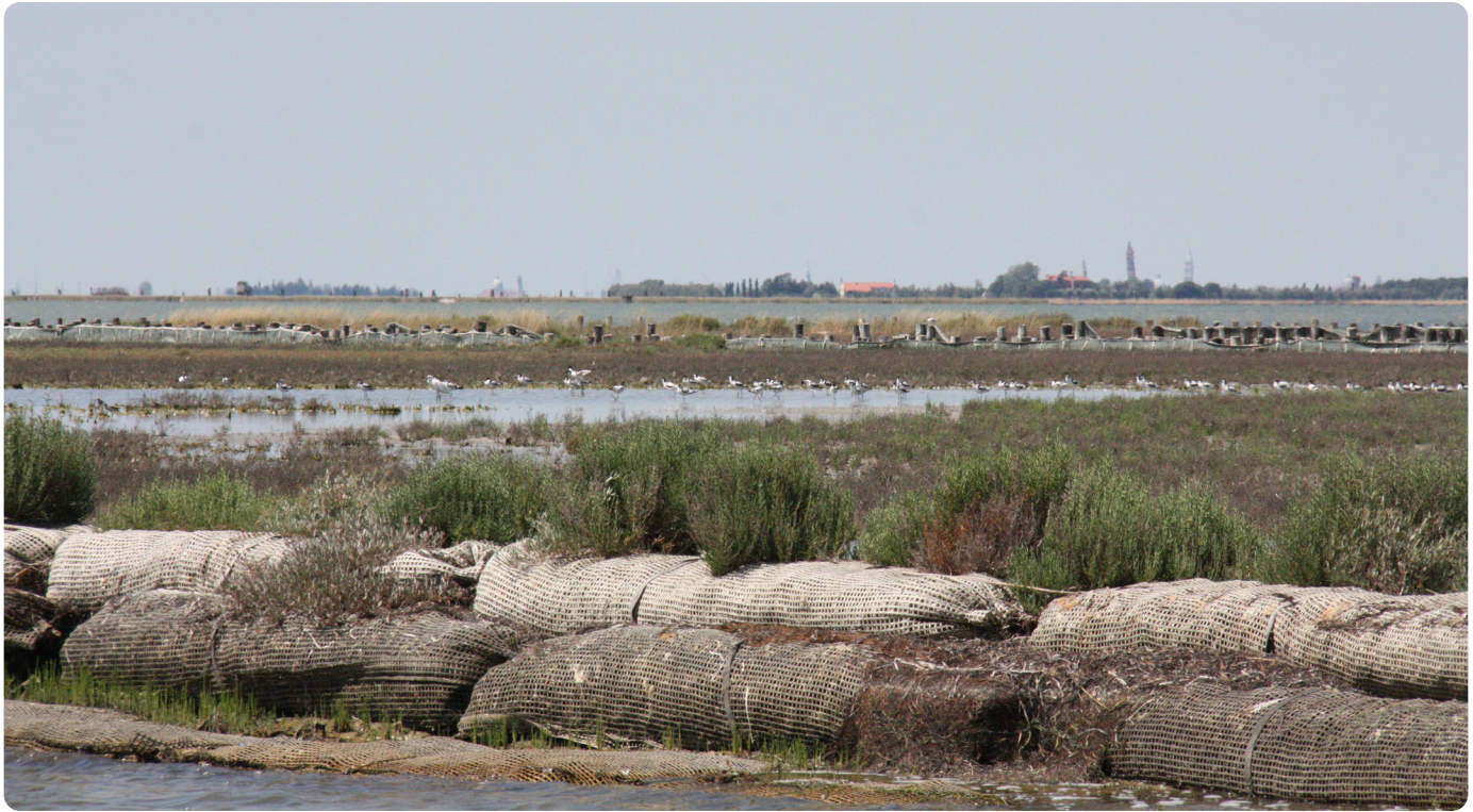
Big clods to protect saltmarsh edges