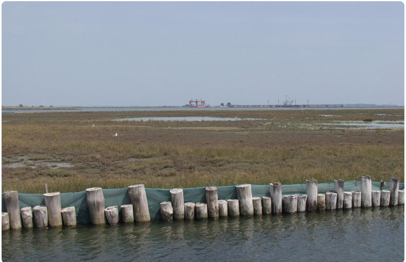
Piling technique to protect salt marsh edges

Part of the stakeholders above mentioned recently signed the "Wetland area contract for the northern lagoon of Venice". As the objectives and actions pursued by this body are in line with those to be pursued within the REST-COAST project, our aim is to engage them, together with all the other relevant stakeholder of the whole lagoon, to plan a negotiated restoration strategy to be discussed and shared by all the administrators of the territory.