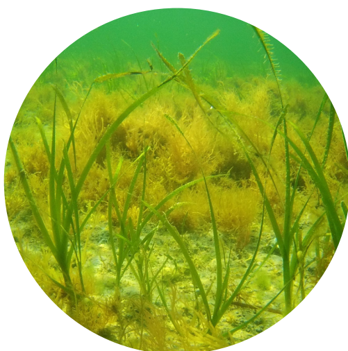
Seagrass Zostera marina