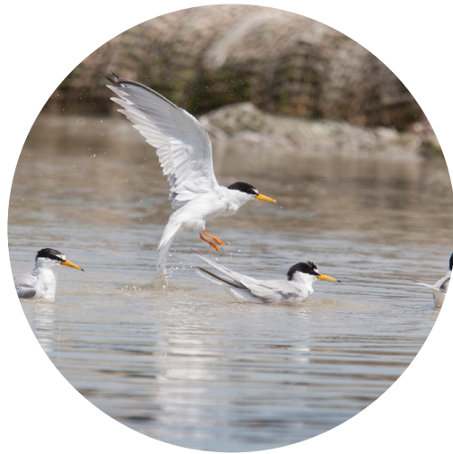
Little tern Sternula albifrons

The ecological functionality, the "dynamic balance", as well as the biodiversity of the Venice lagoon are threatened by a number of factors, both natural (as climate change, subsidence and sea level rise) and anthropogenic processes (i.e. the lagoon alterations caused by the modifications at the lagoon inlets and the excavation of deep channels that contribute to the erosion of the natural lagoon habitats, the low amount of sediments entering the lagoon, the chemical pollution of water, the waves generated by motor boats associated to wind, marine litters and Invasive Alien Species IAS).