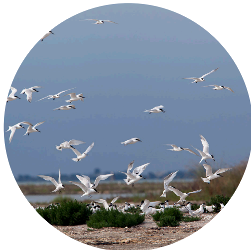
Sandwich tern Sterna sandwicensis

Birds: The lagoon of Venice is the largest Important Bird Area (IBA) on a national scale, counting the highest number of species of Community importance to be preserved (Coccon et al., 2016). A total of 140 breeding species have been recorded in the lagoon, representing around 55% of the known species for Italy, moreover, many of the breeding aquatic species have a restricted areal distribution linked to wetlands, or small populations, whose survival is threatened (Campostrini and Dabalà, 2017).