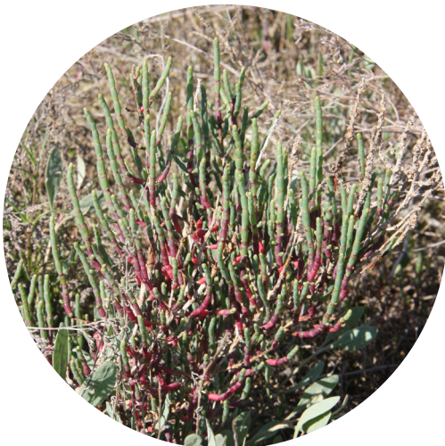
Glasswort plant Salicornia veneta

Fishes: The fish assemblage of the Venice lagoon is made up of 94 species of which marine stragglers is the most abundant category (55 species), followed by marine migrants (16 species), and lagoon residents (15 species) (Scapin et al., 2019). Of these, four species are of EU importance included in the Habitat Directive: Alosa fallax , Aphanius fasciatus , Knipowitschia panizzae , Pomatoschistus canestrinii . Other species, for instance Sparus aurata , Dicentrarchus labrax , Platichthys flesus , Solea solea , Chelon ramada , C. auratus , C. saliens , C. labrosus e Mugil cephalus , which are concentrated in the Venice lagoon at the juvenile stages, represent important stocks exploited for fishing purposes (Cavraro et al., 2017).