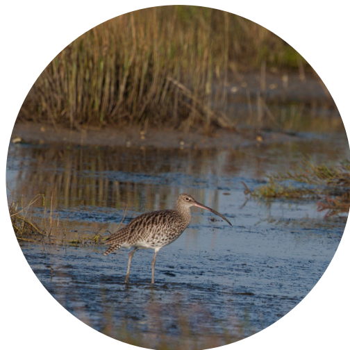
Eurasian curlew Numenius arquata