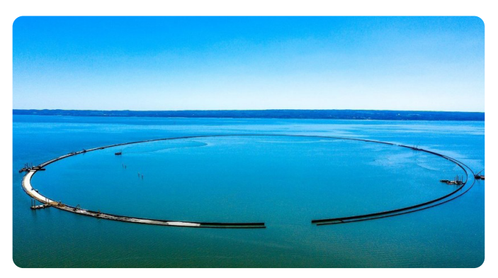
The island – june 2021

this pilot project; currently three artificial islands are planned in the Szczecin lagoon. Moreover, the experience gained during implementation of this pilot can be utilized as a more general approach to biodiversity restoration in basins, mostly lagoons and estuaries, located in moderate latitudes.