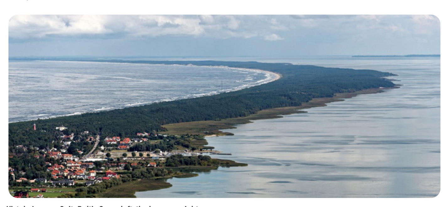
Vistula Lagoon Spit: Baltic Sea – left, the lagoon – right

island serving as biodiversity restoration habitat. Their institutional powers are absolutely necessary for project success. The Polish Society for the Protection of Birds (OTOP) will be consulted during project implementation. IBW PAN, MO and OTOP will form the core-plat for Vistula Lagoon pilot.