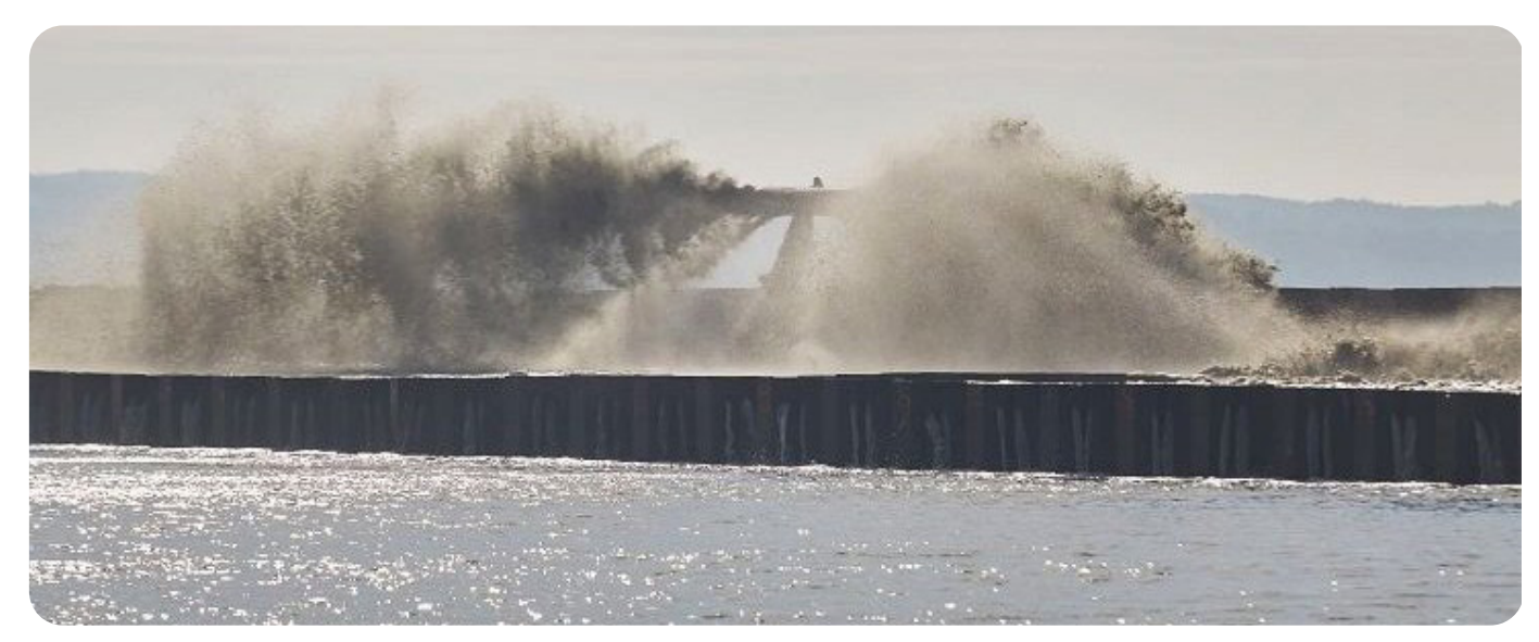
The island under construction

The primary restoration function is the provision of the resting grounds for ducks (gadwall, shoveler, widgeon), grey, bean and white-fronted geese, and later the hatching grounds for snipe, northern lapwing and redshank. These services will be protected by restricted access to the site, enforced by coastal authorities, and monitored with the assistance and advice of ornithologists. Later, shallow seabed rimming the island's banks will be naturally transformed into a spawning area of important, local fishes (bream, pike perch) by inducing natural appearance of reeds. In this way nature based solutions are promoted. Development of this spawning ground will be consulted with ichthyologists.