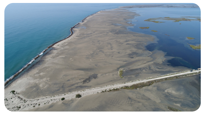
Illustration of the appearance of new beach areas in the south of the buffer area, due to overwash processes in the context of non-maintenance of the historic sea-dikes protection. Mediterranean Sea – left, lagoons – right. © Willm and Arnaud, Tour du Valat.