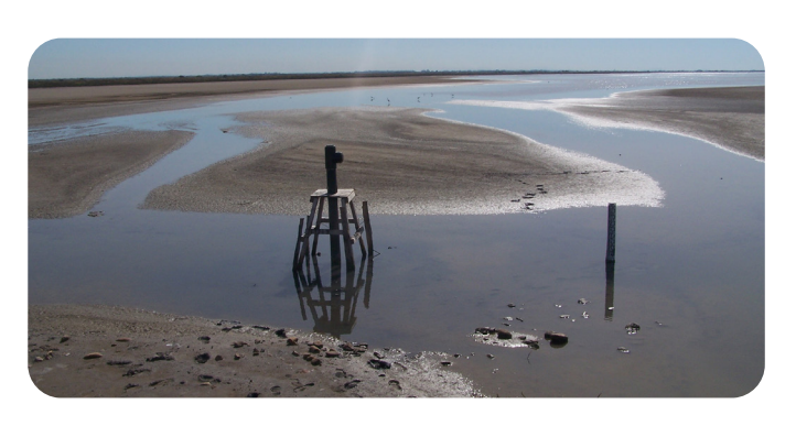
Illustration of the very low water depths that can occur on the site, with the possibility of most areas drying up for part of the year.