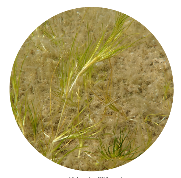
Althenia filiformis