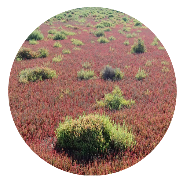
Salicornia and other annuals colonising mud and sand © Fontes, Tour du Valat.