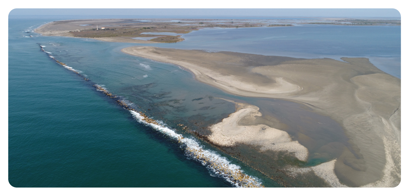
Illustration of the restoration of the natural coastal dynamics in the south of the buffer area, due to the non-maintenance of the historic sea-dikes protection. Mediterranean Sea – left, lagoons – right. © Willm and Arnaud, Tour du Valat.