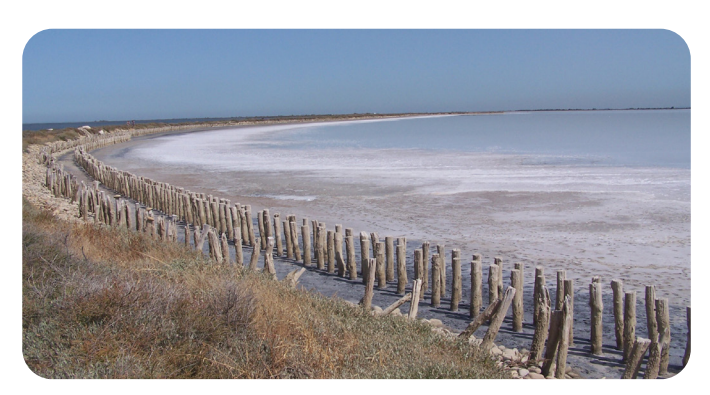
Illustration of the very high salinities that can occur on the site, with possible salt crystallisation.

During REST-COAST, the objective is to restore 300 ha of coastal lagoons, and 60 ha of Mediterranean halophilous scrubs/Salicornia and other annuals colonising restored mud/sand. It is also expected that with the non-maintenance of the historic seadikes protection and the re-establishment of natural coastal dynamics, new beach areas will appear in the south of the site (overwash processes).