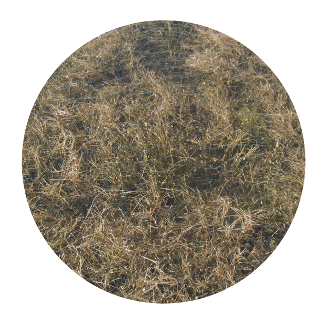
Ruppia cirrhosa