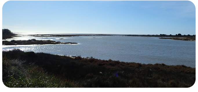
One of the coastal lagoons targeted for restoration, in the south of the buffer area, © Fontes, Tour du Valat.