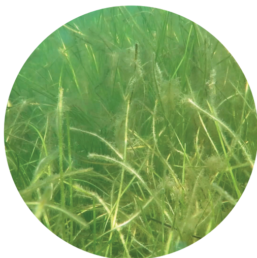
Seagrass ecosystem