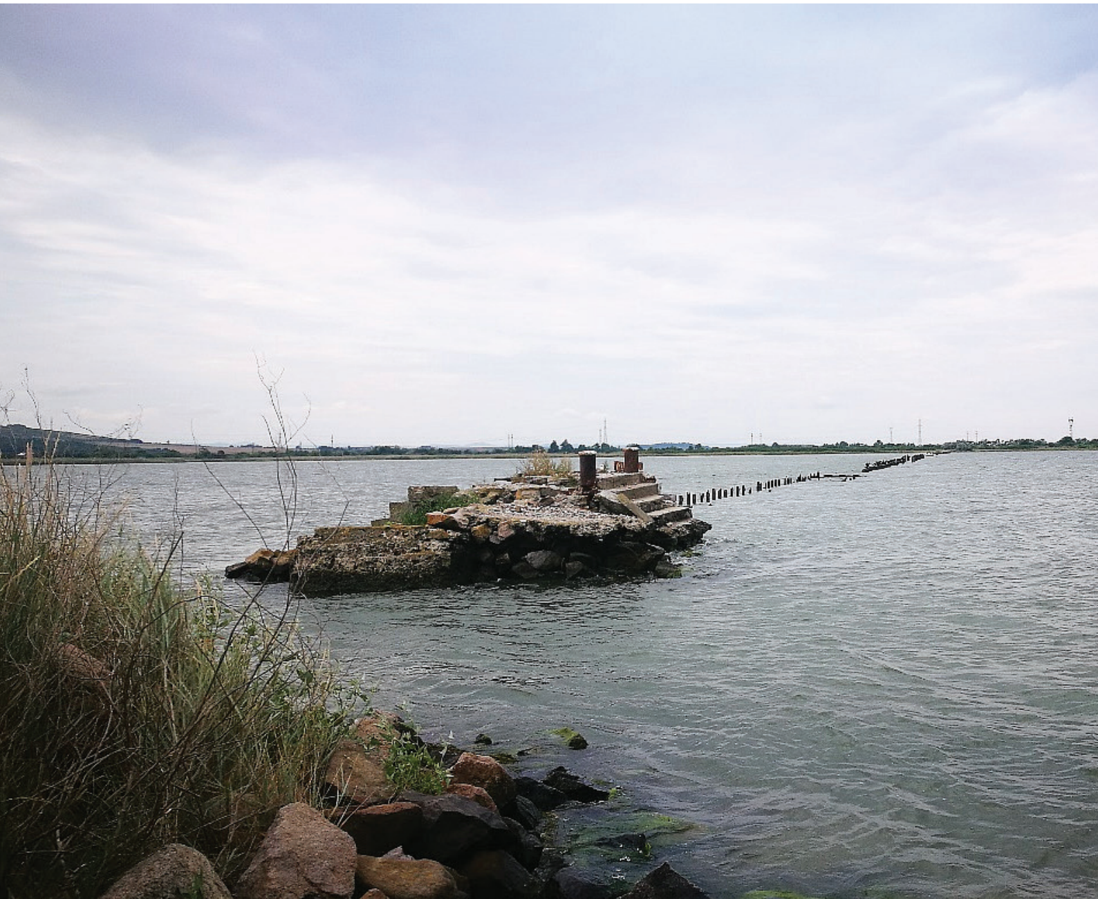
Heavily modified Foros Bay area showing the former fishing “guard”