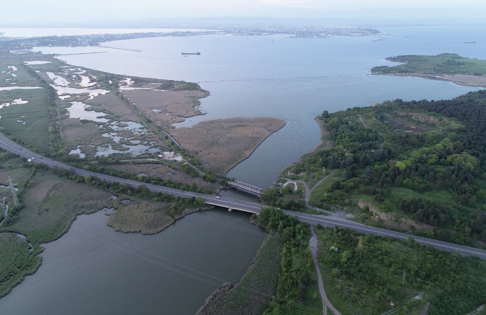
Foros Bay pilot site, Photo by eng. Bogdan Prodanov, PhD