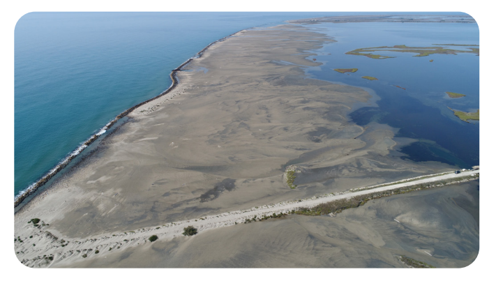
Illustration of the appearance of new beach areas in the south of the buffer area, due to overwash processes in the context of non-maintenance of the historic sea-dikes protection. Mediterranean Sea – left, lagoons – right.