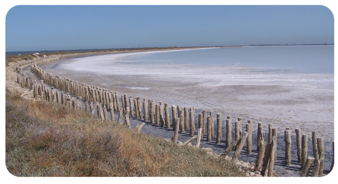
Illustration of the very high salinities that can occur on the site, with possible salt crystallisation.

During REST-COAST, the objective is to restore 300 ha of coastal lagoons, and 60 ha of Mediterranean halophilous scrubs/Salicornia and other annuals colonising restored mud/sand. It is also expected that with the non-maintenance of the historic seadikes protection and the re-establishment of natural coastal dynamics, new beach areas will appear in the south of the site (overwash processes).