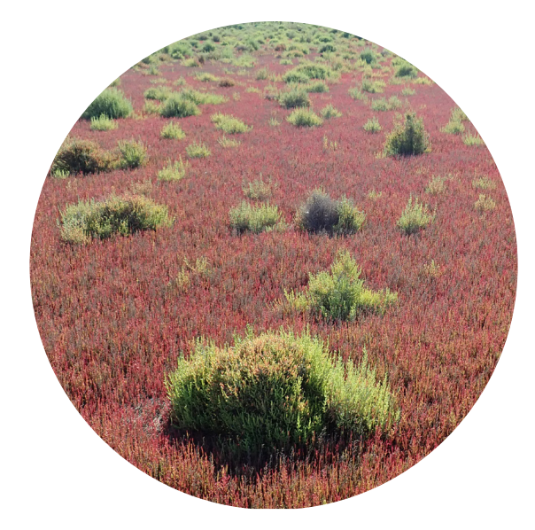
Salicornia and other annuals colonising mud and sand