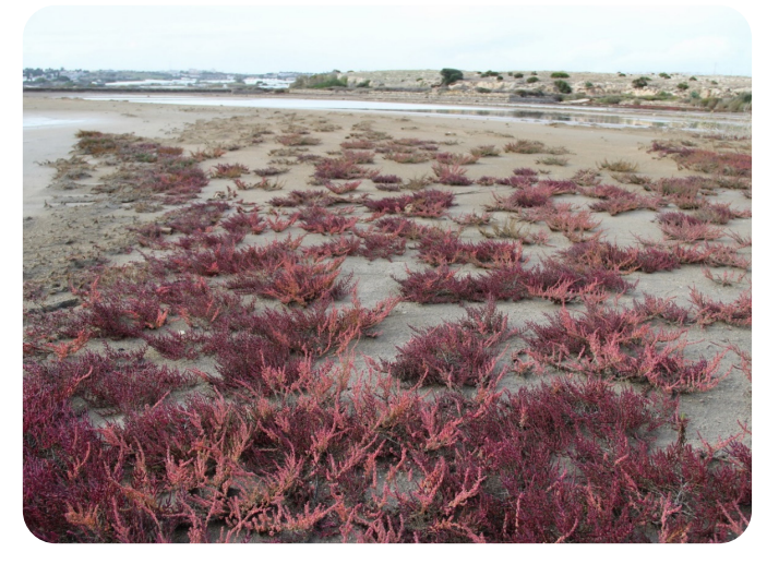
Prairies of Salicornia perennas at Morghella Lagoon