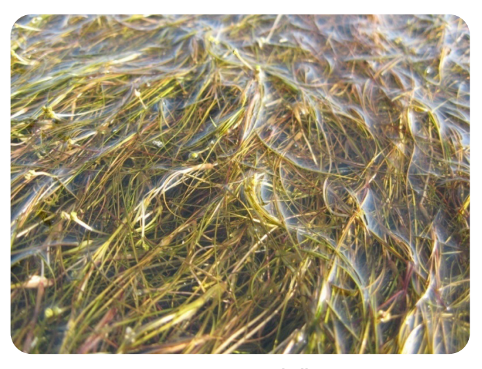
Maritime rupia at Morghella Lagoon