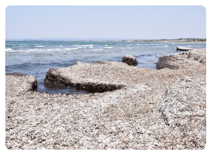
Banquettes of Posidonia Oceanica on the beach