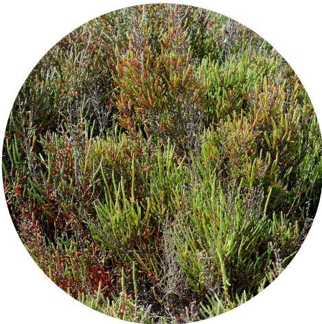
Salicornia Arthrocnemum fruticosum

With this in mind, the major risks the project will have to address include flooding/erosion and the improvement of water quality in the coastal lagoons.