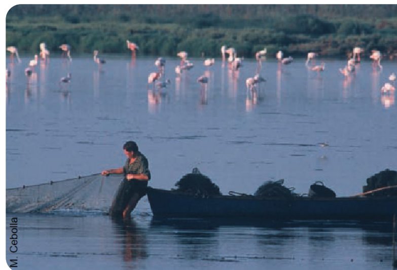
Artisanal fishing in the Ebro Delta