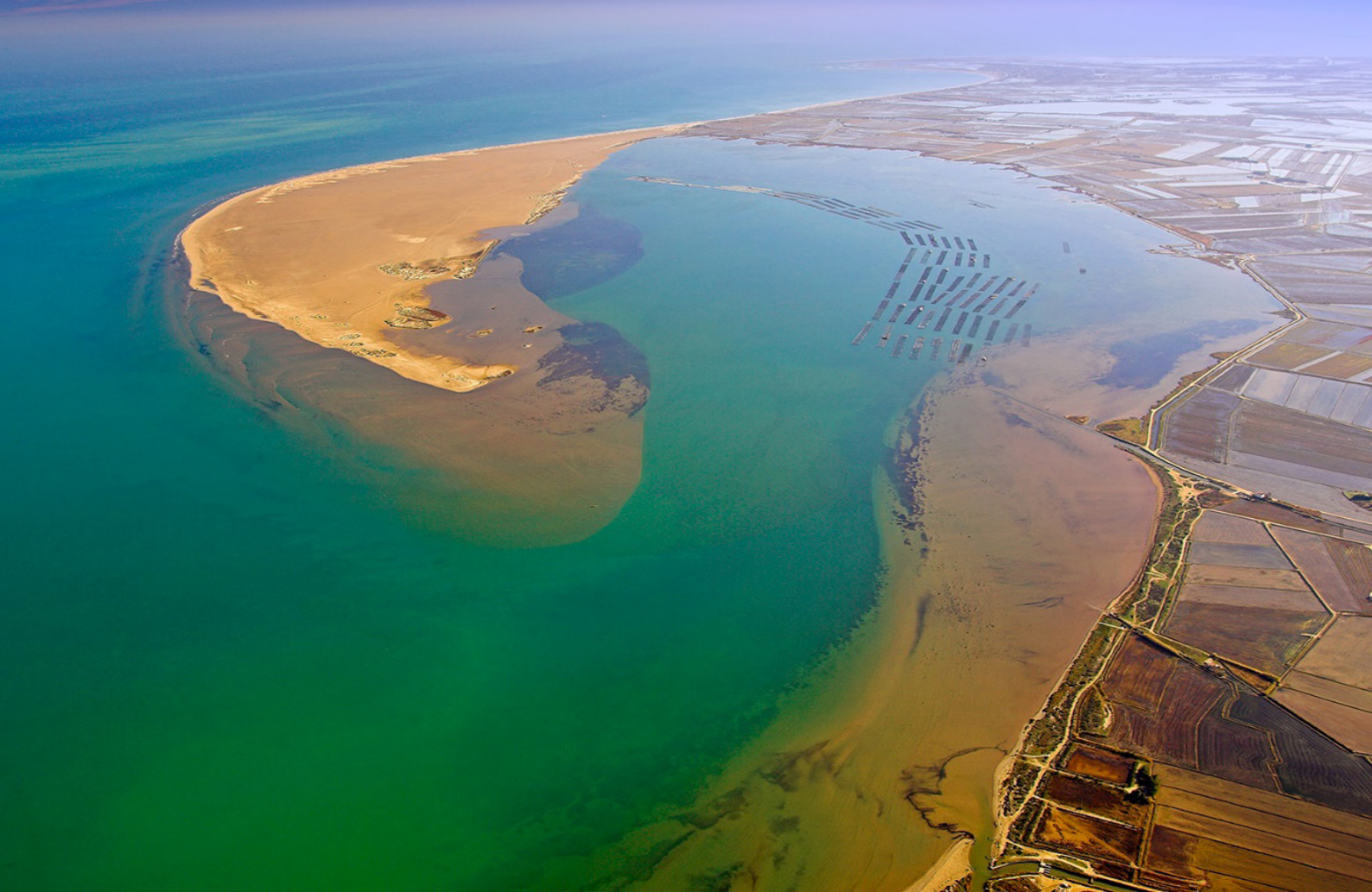
Fangar Bay, in the northern hemidelta, with the bivalve farms