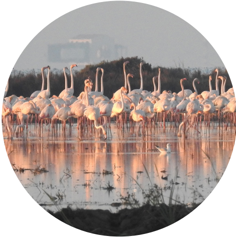
Greater flamingo Phoenicopterus roseus