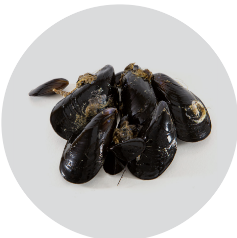
Mediterranean mussel Mytilus galloprovincialis