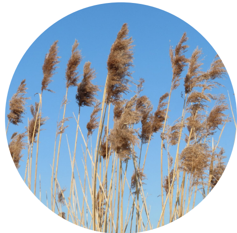
Common reed Phragmites australis