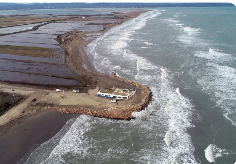
Rigid coastal structure protecting the Vascos restaurant.