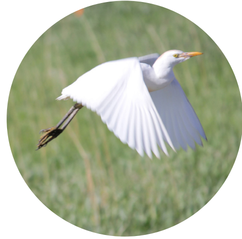
Cattle egret Bubulcus ibis