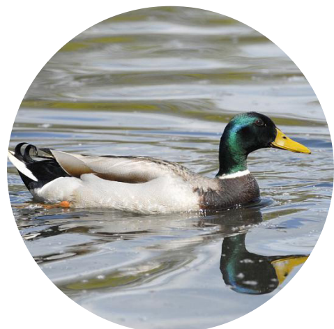
Mallard Anas platyrhynchos